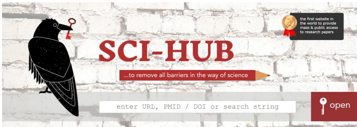
Figure 1. A raven as the logo representing Sci-Hub.