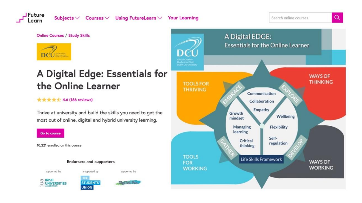
Figure 3. A Digital Edge free online course

In our work, the importance of caring for learners and giving greater attention to their emotions during the pandemic was explicitly addressed in a free online course, A Digital Edge: Essentials for the Online Learner. This course was launched in September 2020 through the FutureLearn platform and has attracted over 10,000 learners, with more than a 50% completion rate. Notably, the course is co-facilitated by students and anchored in an adapted version of the LifeComp Framework (Sala et al., 2020) which places a strong emphasis on empathy and wellbeing (see Figure 3). Another strong emphasis is the assumption that learning how to learn online is now an essential life skill (Beirne et al., 2021).